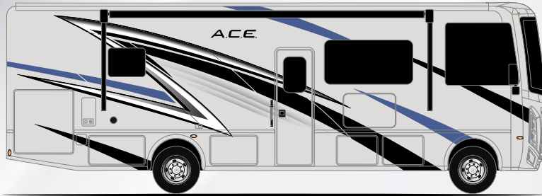
RIVER WALK II HD-MAX